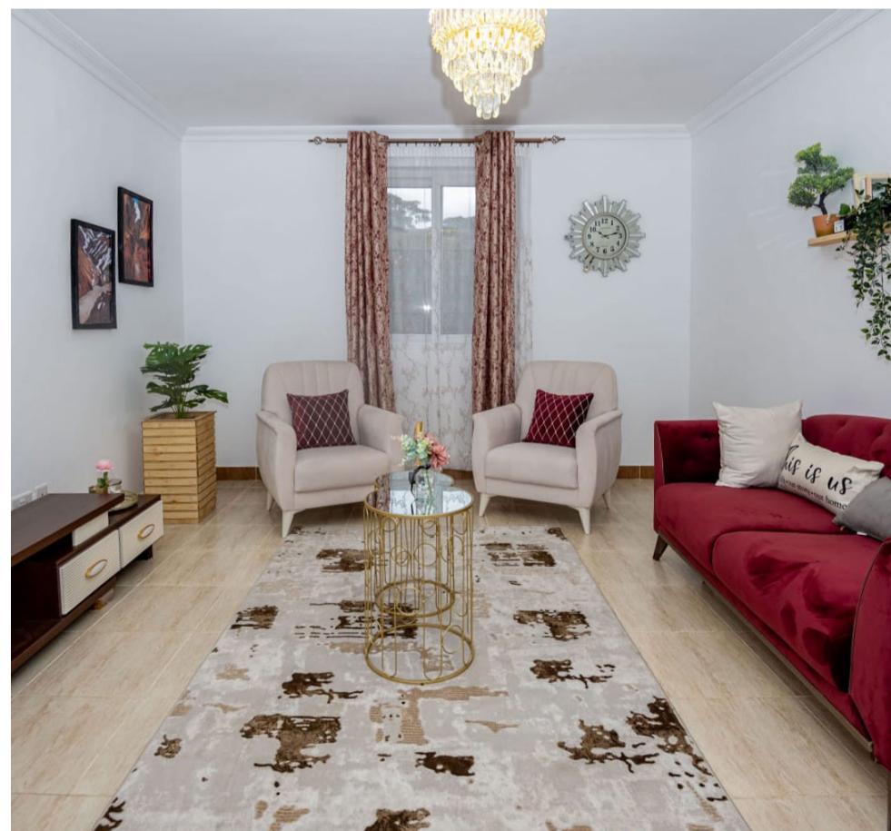
Inside one of the units of the Bondeni Housing Project in Nakuru County.

housing and settlement is central to the government's quest to make Kenya the ‘Singapore of Africa’ – an ambitious plan by President Ruto to move Kenya from a lower-middle-income economy to first-world status through industrialisation,