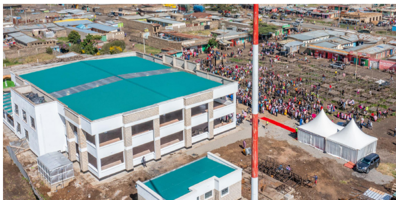
An aerial view of the Suswa ESP market in Narok County accommodating 200 traders.

“This is more than just a marketplace, it’s a vision brought to life. Designed to support over 300 traders, the Suswa ESP Market blends innovation with dignity. From smart stalls and cold/dry storage to an ICT hub, lactation