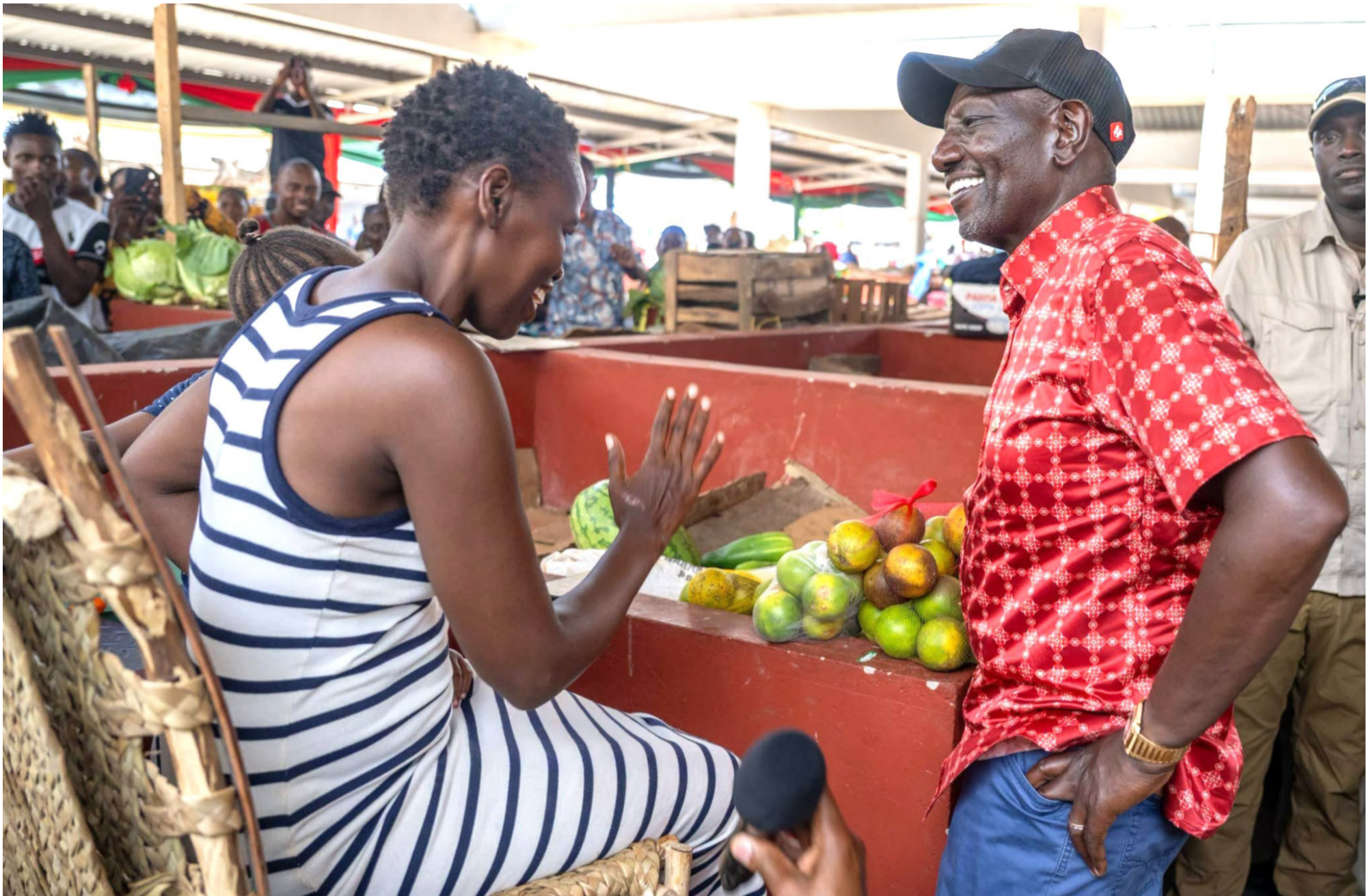
President William Ruto interacts with one of the traders at the Diani Modern Market in Msambweni on May 23, 2026.