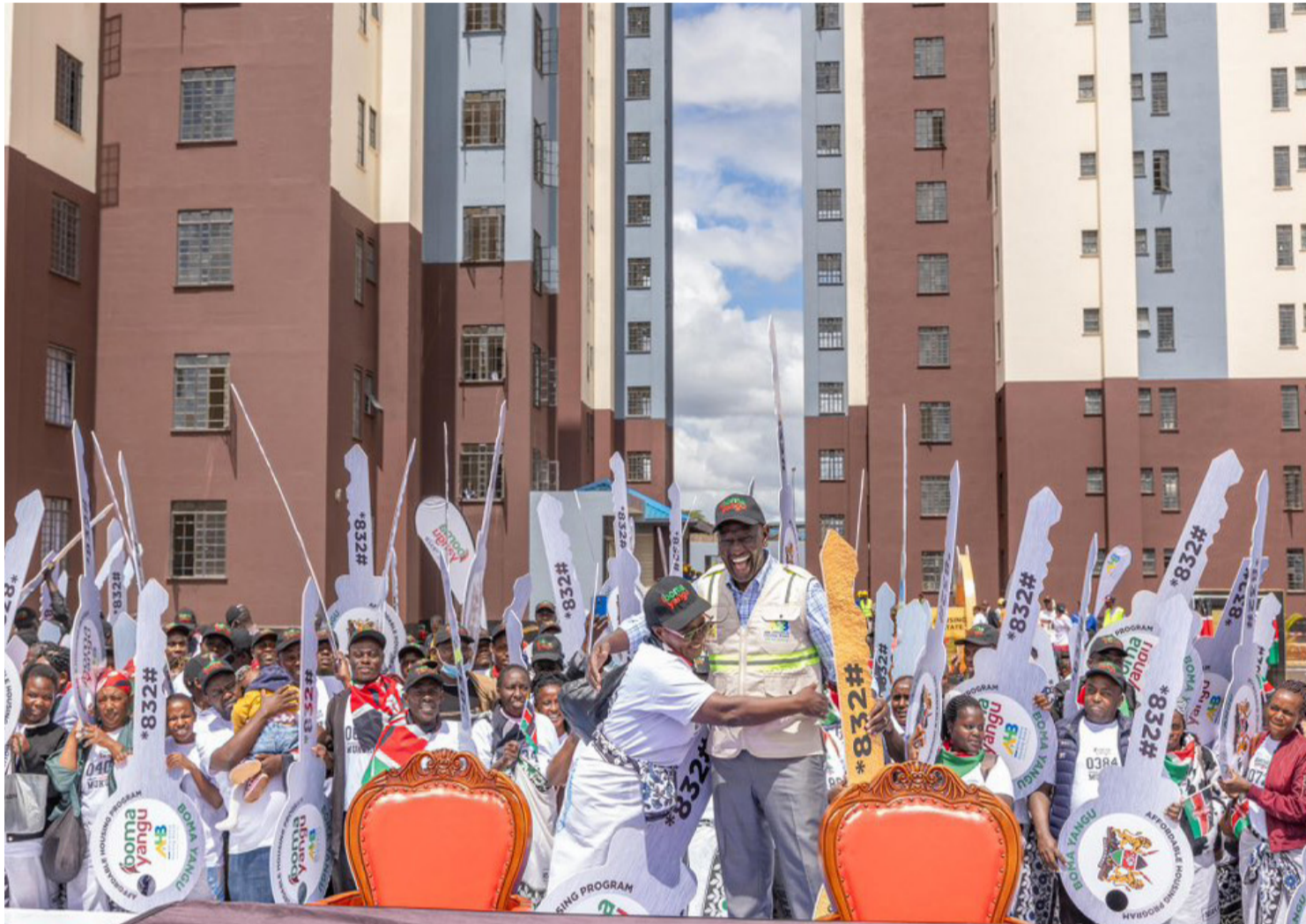
President William Ruto when he commissioned the Mukuru Housing Estate Lot 1, Phase 1 houses in Nairobi on May 20, 2025.