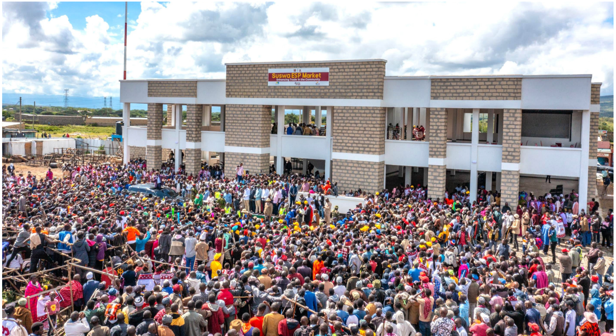
President William Ruto addressing residents during the official opening of the Suswa ESP market on May 6, 2025.