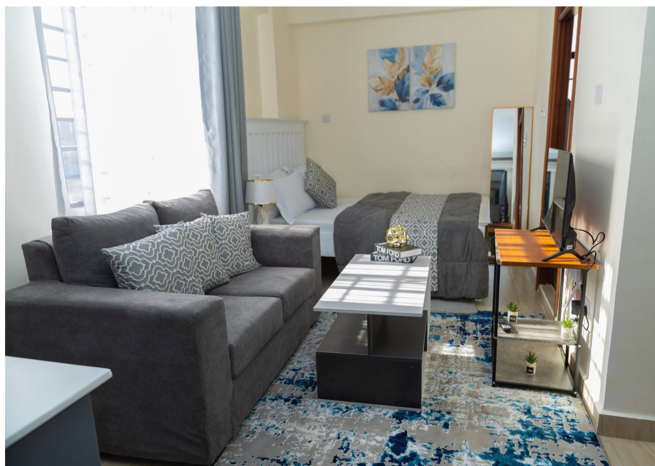
Inside one of the units of the affordable houses in Mukuru Kwa Njenga, Nairobi County on May 20, 2025.

At the same time, a three-bedroom house 80sqm went for Ksh4,000,000.