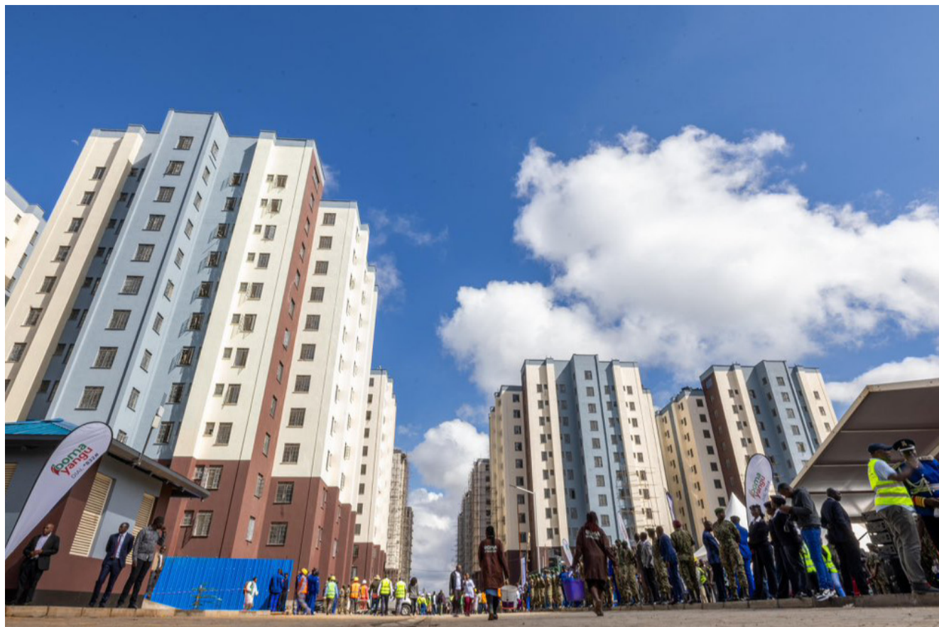
Affordable houses in Mukuru Kwa Njenga, Nairobi County on May 20, 2025.