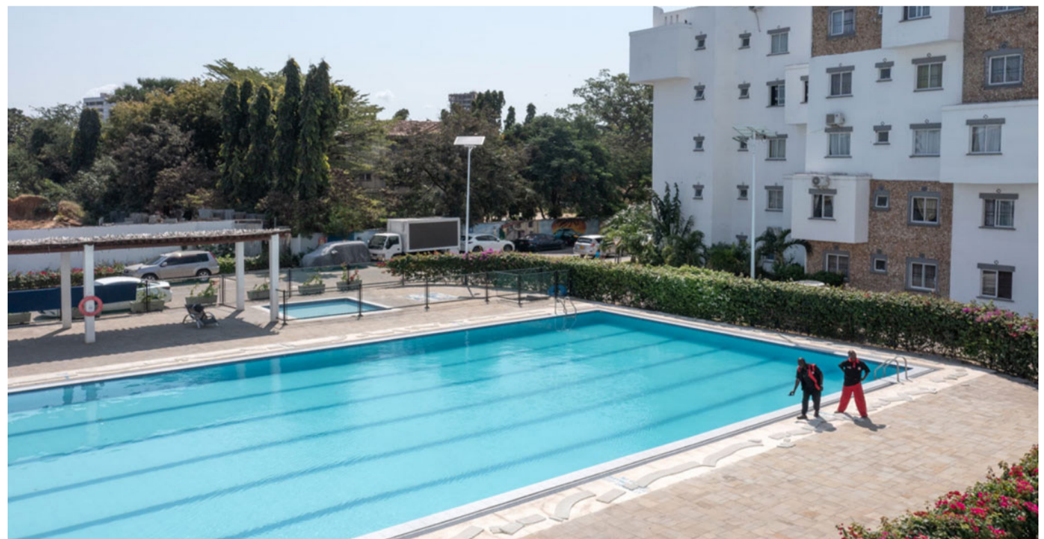
The project has community amenities such as a swimming pool, playgrounds, church, mosque, and a market.

According to the government, the ambition includes constructing and equipping TVET institutions in 52 constituencies, equipping 72 existing TVET institutions, recruiting 2,000 technical trainers and instructors, establishing incubation centres in every TVET