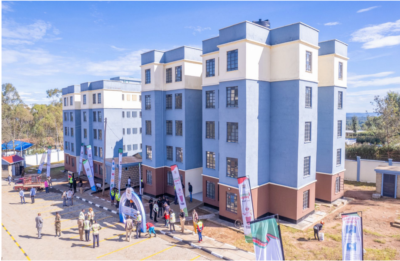
Mabera Affordable Housing estate in Kuria West, Migori County.

emphasised that the Bottom-Up Economic Transformation Agenda (BETA) has enabled the residents to become homeowners.