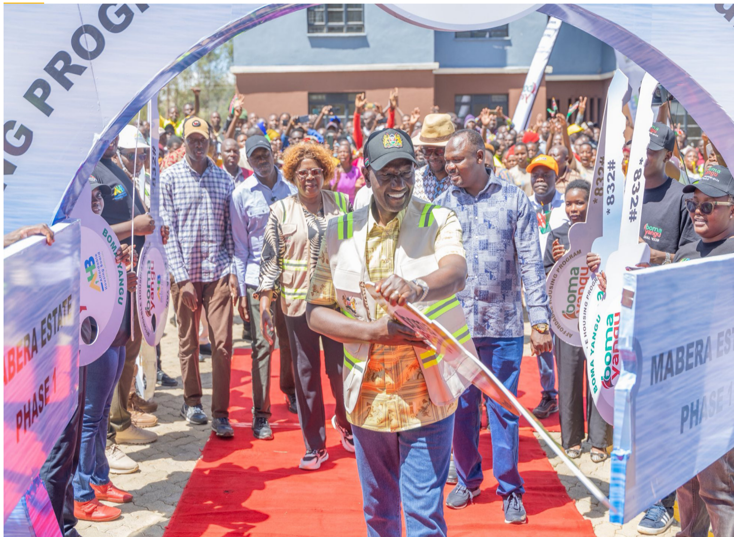
President William Ruto when he officially commissioned the Mabera Affordable Houses in Migori County on March 23, 2026.

The successful completion of two affordable housing projects in Nyanza has facilitated steady urban growth, eased the housing pressure, and ensured orderly settlement in the regions.