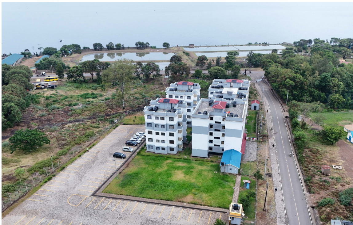
A beautiful view of Lake Victoria at the Homa Bay affordable houses.

During unveiling of the project in March this year, President Ruto