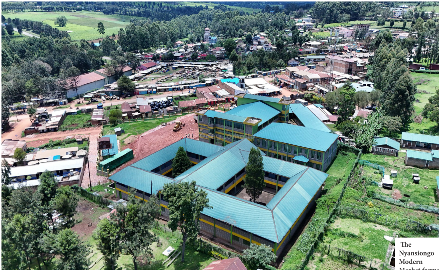
The Nyansiongo Modern Market forms part of the Government's broader effort to strengthen market infrastructure while enhancing the safety and dignity of small-scale traders.