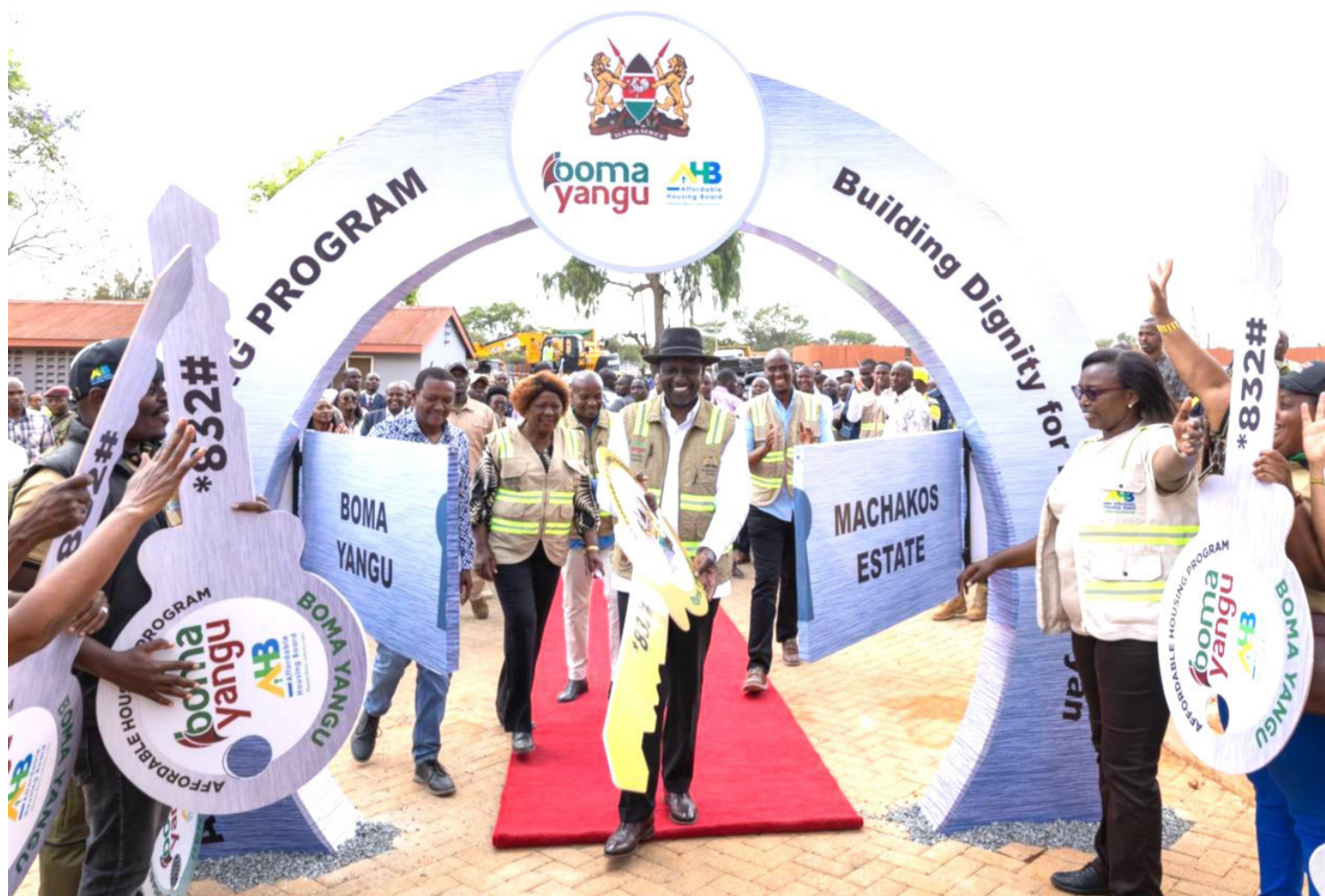
President William Ruto officially handed over the Machakos Housing Project houses to their new owners on November 14, 2025.