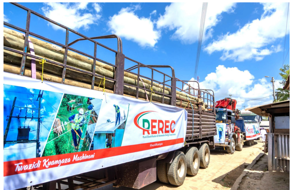
Rural Electrification and Renewable Energy Corporation (REREC) truck carrying electricity poles to be used in connecting power to homes in Kwale County.

Since its launch, the report underscored, the transformative project has brought a stream of benefits to beneficiaries stretching from generation of job opportunities