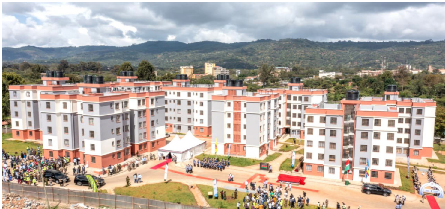
A view of the Machakos Affordable Housing projects that were handed over to beneficiaries by President William Ruto on November 14, 2025.