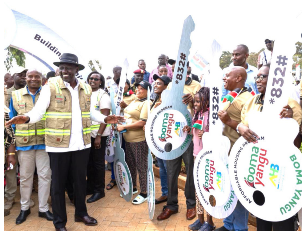
President William Ruto handing over dummy keys to new house owners of the Machakos Housing Project on November 14, 2025.

Additionally, a two-bedroom unit under the social scheme is purchased at Ksh1,280,000, with the buyer required to pay Ksh6,800 as rent every month, while under Affordable Housing it costs one Ksh2,000,000 to buy and Ksh14,450 as rent every month. Under Market Housing scheme, it goes for Ksh2,400,000 with a monthly rent