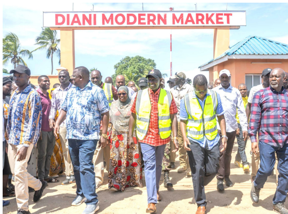
President William Ruto when he officially Handed over the Diani Modern Market in Msambweni Constituency, Kwale County on May 23, 2026.

In Lamu County, Kizingitini Fish Market in Lamu East Constituency and the Hindi Modern Market in