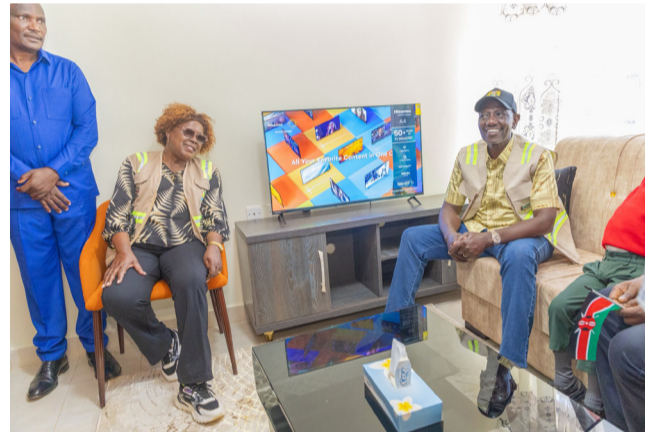
President William Ruto (R) chilling with Lands Cabinet Secretary, Ministry of Lands, Public Works, Housing and Urban Development Alice Wahome and her Treasury Counterpart John Mbadi in one of the Mabera estate houses on March 23, 2026.

The two-bedroom is also available on the market at a cost of Ksh2,400,000 with a rent of Ksh21,160.