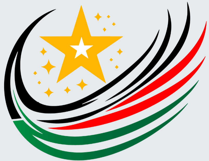
Milestone Badge platform logo.

The platform's reporting structure revolves around key development pillars that shape everyday life in Kenya. These include physical infrastructure such as roads, stadiums, schools, hospitals, boreholes, and housing projects; electricity and renewable energy; digital and