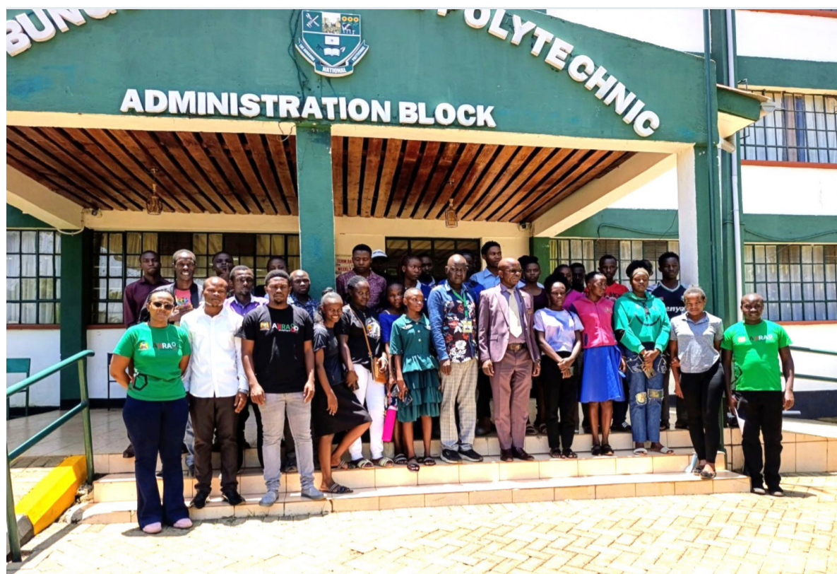
Bungoma National Polytechnic students pose for a group photograph after a training session from March 9, 2026 to March 13, 2026 through the hub.